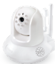
IC-7113W PT IoT Cam