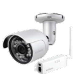
IC-9110W Mini Outdoor Cam