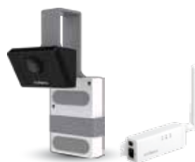
IC-6230DC Door Hook Cam