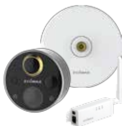
IC-6220DC Peephole Cam