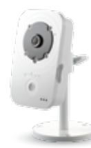
IC-3140W Cube Cam