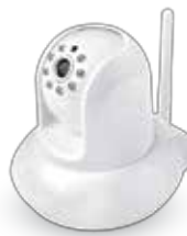
IC-7112W PT Cam