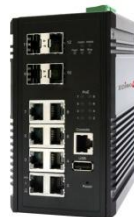
IGS-5408P Industrial 8-Port Gigabit PoE+ Web Managed Switch with 4 SFP Slots