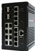
IGS-5416P Industrial 16-Port Gigabit PoE+ Web Managed Switch with 8 PoE+ Ports & 4 SFP Slots