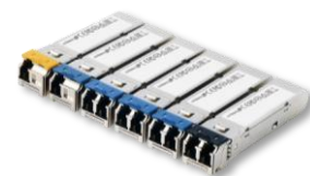
MG-1000 Series V2 1000Base-T SX LX SFP Modules