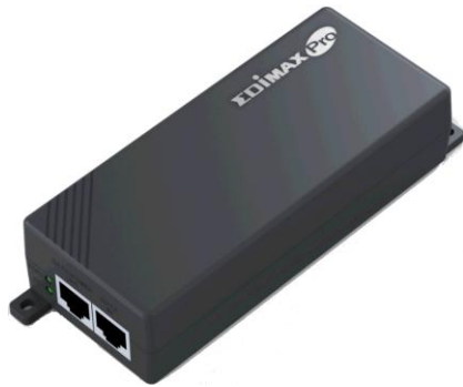
GP-101IT PoE Injector