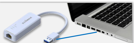
Convert USB Port to Ethernet Port